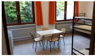
Bedroom and Livingroom for 4 persons