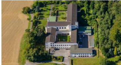
Accommodation for about 500 people